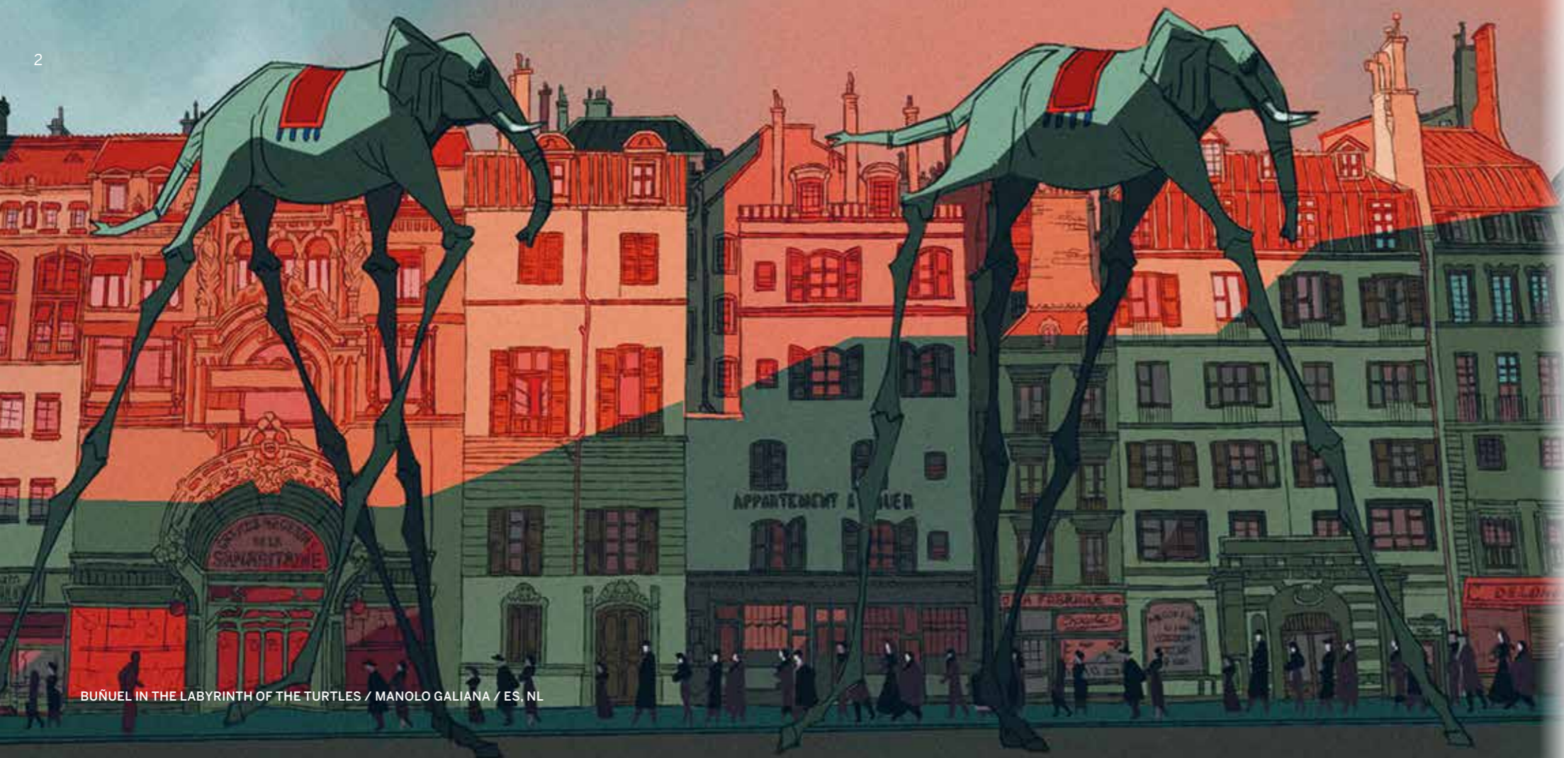
BUÑUEL IN THE LABYRINTH OF THE TURTLES / MANOLO GALIANA / ES, NL